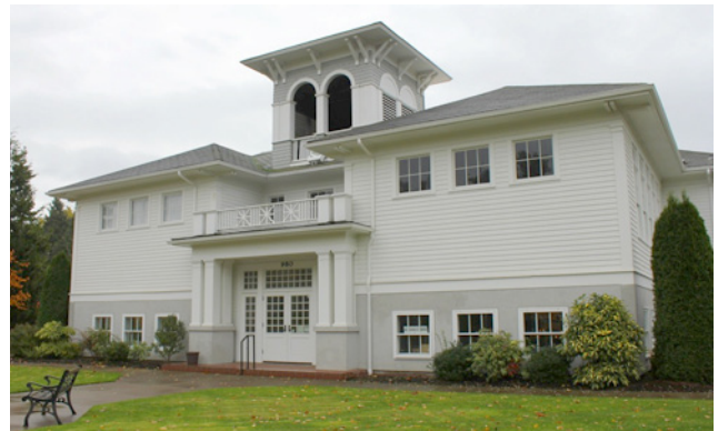
Keizer Cultural Center, Keizer, Oregon

980 Chemawa Rd NE Keizer, OR 97303-3716 Phone: (503) 390-3010 Email: keizerarts@gmail.com Website: www.keizerarts.com