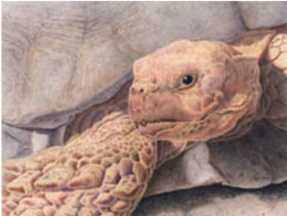
The Reaching Gaze