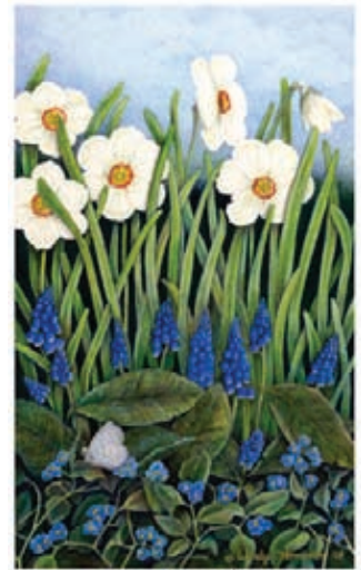
Spring Azure Blue

Wendy Thompson's (McMinnville, OR) colored pencil work titled "Spring Azure Blue" will be included in Ann Kullberg's new book Colored Pencil Secrets for Success . This book is yet to be released by F + W Publications and will soon be available through North Light Books.