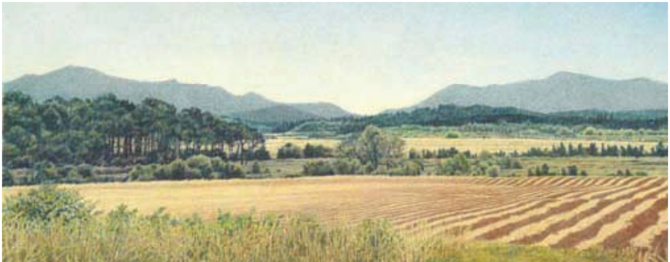
Above is a recent 32" x 72" landscape by Mike Pease commissioned by the Riverbend Hospital in Springfield. Mike used only three colors (True Blue, Canary Yellow, and Magenta)—no black.

Mike will also show you stroke options that range from a very fine point to the stroke that he uses most of the time, which uses the lead’s full thickness. So you’ll learn how to whittle the wood away from your pencil lead. Mike will discuss the various ways of applying pencil to paper and the kind of drawing (and drawing process) that results—how fast, how big, how abstract. Through a series of exercises, you’ll experiment with color and strokes in ways that just might get you thinking about new possibilities for your own work.