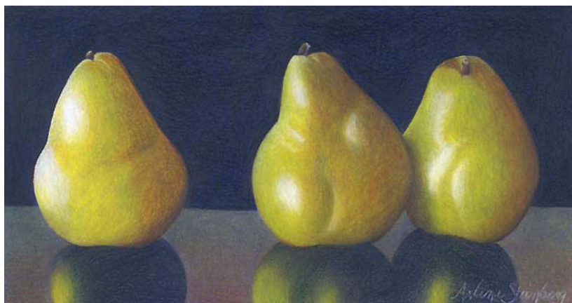
All Paired Up , Arlene Steinberg, CPSA