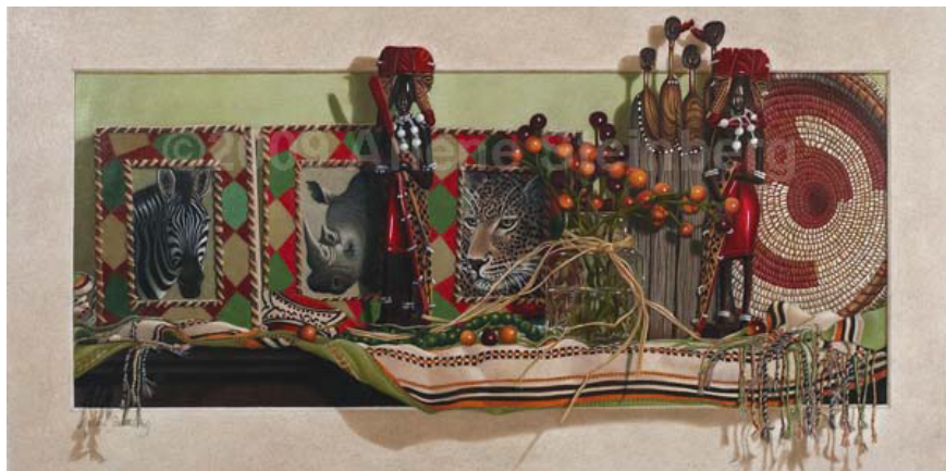
Out of Africa , Arlene Steinberg, CPSA